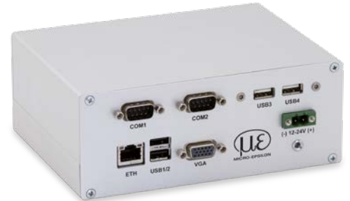
thermoIMAGER TIM NetPCQ