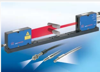
Optical micrometers and fiber optics, measuring and test amplifiers