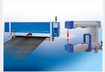
Measuring and inspection systems for metal strips, plastics and rubber