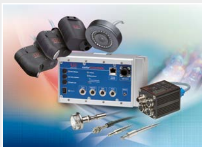
Color recognition sensors, LED analyzers and inline color spectrometers