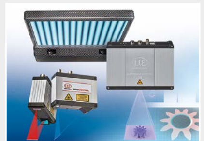
3D measurement technology for dimensional testing and surface inspection