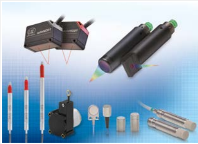
Sensors and systems for displacement, distance and position