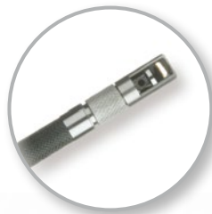
90° prism head (optional)