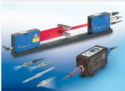
Optical micrometers and fiber optics, measuring and test amplifiers