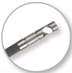
90° mirror head