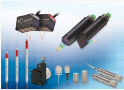
Sensors and systems for displacement, distance and position