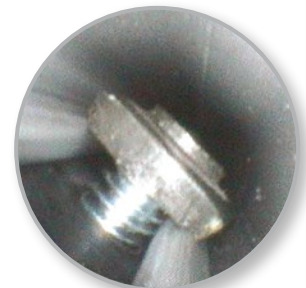
Position of a screw