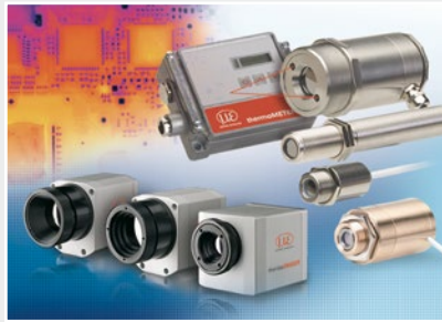
Sensors and measurement devices for non-contact temperature measurement