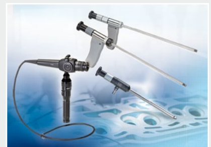
Industrial endoscopes, light sources