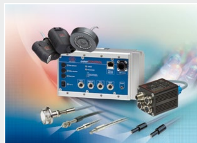
Color recognition sensors, LED analyzers and inline color spectrometers