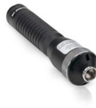
SuperNova LED hand light source