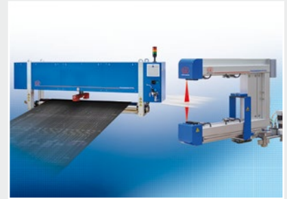
Measuring and inspection systems for metal strips, plastics and rubber