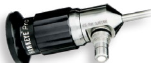
Fiber optic connector