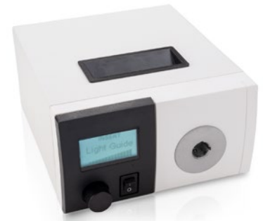
FOT LED 3000 / 5100