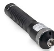
SuperNova LED hand light source