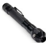
LED hand-held light source