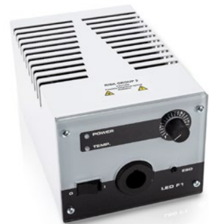
FOT LED without fan

*depending on the ambient temperature, room humidity and the intensity set