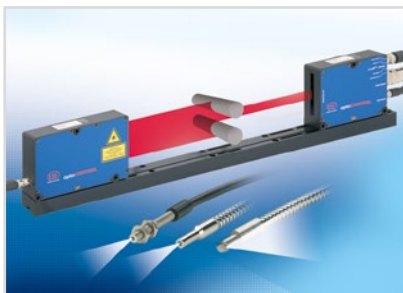
Optical micrometers and fiber optics, measuring and test amplifiers