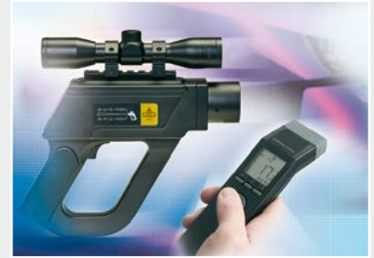
thermoMETER Handheld Innovative handheld pyrometer with laser sighting for inspection and maintenance