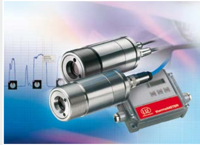
thermoMETER CTVideo/CSVideo Infrared temperature sensors with crosshair laser sighting and video output