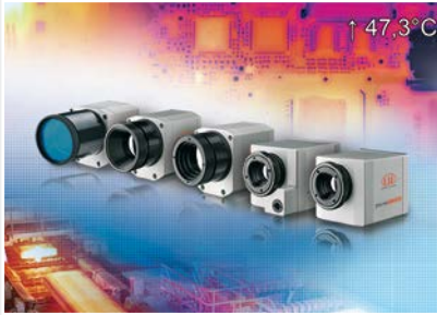
thermoIMAGER TIM Compact USB thermal imaging cameras for precise thermography