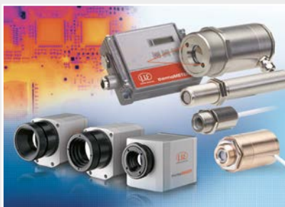
Sensors and measurement devices for non-contact temperature measurement