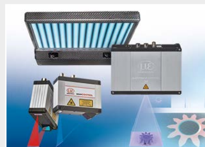
3D measurement technology for dimensional testing and surface inspection