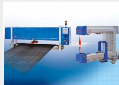
Measuring and inspection systems for metal strips, plastics and rubber