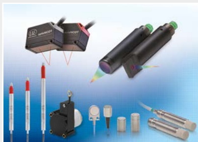
Sensors and systems for displacement, distance and position