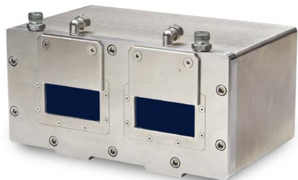
SGHx ILD size M (140 x 180 x 71 mm) for optoNCDT 1750 / 2300 dimensions 150 x 80 mm