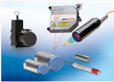
Sensors and systems for displacement and position