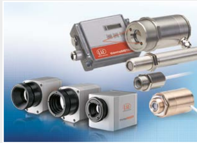
Sensors and measurement devices for non-contact temperature measurement