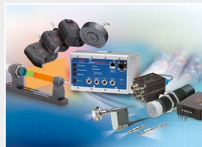
Color recognition sensors, LED analyzers and color inline spectrometer