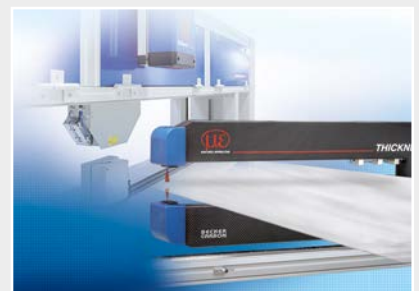
Measurement and inspection systems