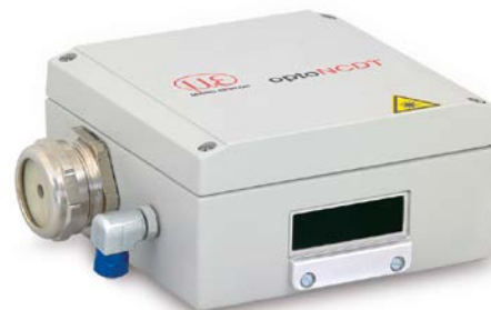
SGHx ILD size S (140 x 140 x 71 mm) for optoNCDT 1750 / 2300 dimensions 97 x 75 mm

Minimum water flow rate Q(\min) = 3\text{ liters/min}