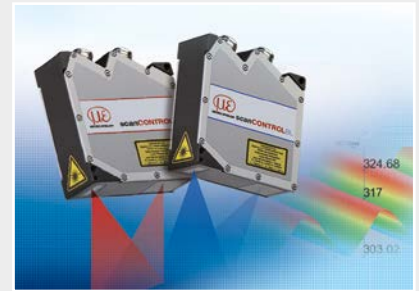
2D/3D profile sensors (laser scanner)