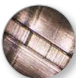
Signs of abrasion

incl. Mini Maglite, carrying case, 90° mirror tube, protective tube, 2x AA batteries and cleaning set