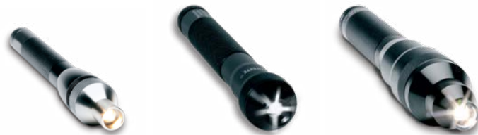
Mini Maglite hand light source LED hand light source SuperNova LED hand light source