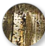
Cracks due to heat