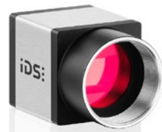
Endo CU &lt;&lt; 1/2.3" 18 MP