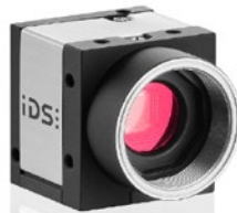
Endo CU1/3" 1.3 MP