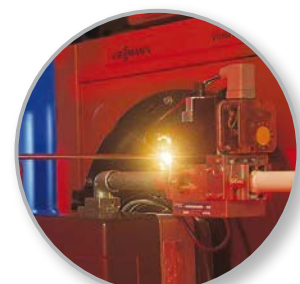
Inspection of heating system combustion chambers