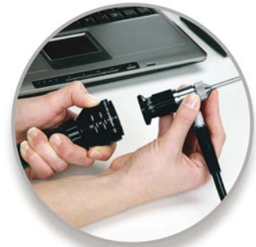
Attachment of camera and lens onto endoscope