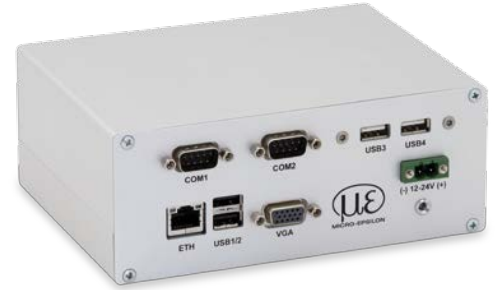
thermoIMAGER TIM NetPC