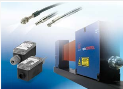
Optical micrometers, fibre optic sensors and fibre optics