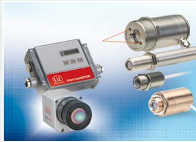
Sensors and measurement devices for non-contact temperature measurement