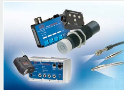
Colour recognition sensors, LED analyzers and colour online spectrometer