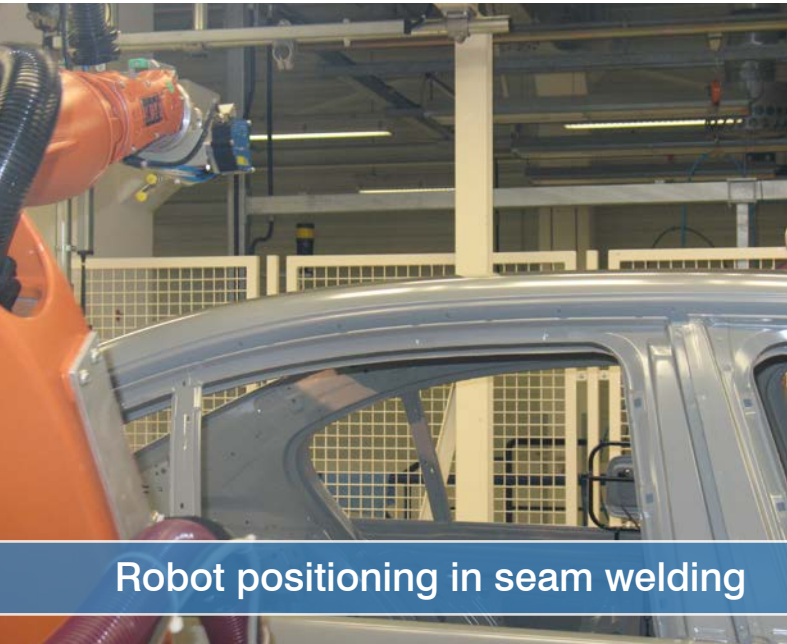
Robot positioning in seam welding