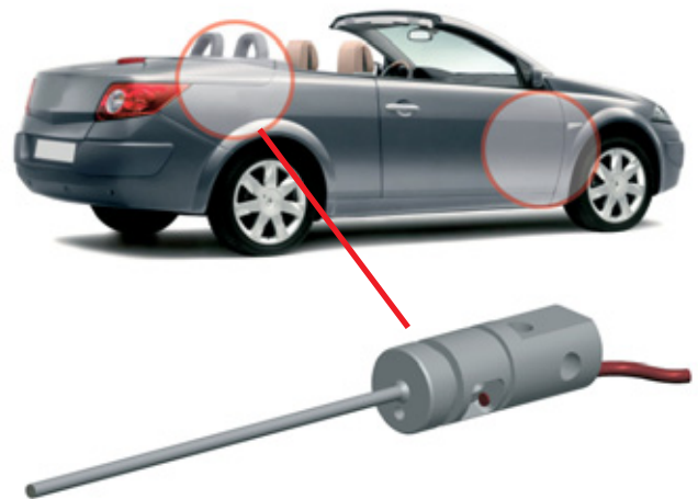
Displacement sensor for hydraulic cylinder for trunk lid