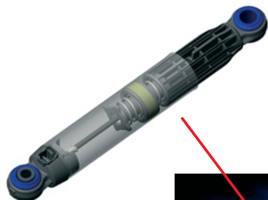
Frictional damper for washing machines with integral sensor