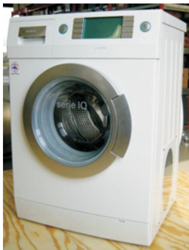
SIEMENS Washing Machine Series Iq1430

The operation and washing results are optimized through the load measurement. The displacement sensor supplies an output signal proportional to the weight of washing. The sensor signal is converted by the electronics into a visible bar display for the user. The momentary loading status is continuously displayed visually, enabling the washing drum to be optimally and fully loaded. In parallel to this, the amount of washing agent is calculated depending on the load and displayed. The operating costs are reduced and the environment is also preserved. The sensing of unbalance enables the speed to be adapted during the spin-dry stage. The running of the appliance and the spin-drying performance are improved and the service life increased.