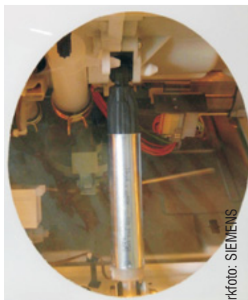
SUSPA frictional damper with integrated displacement sensor RD 32 FKS